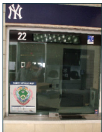
FIGURE 6. NY Yankees ticket booth.