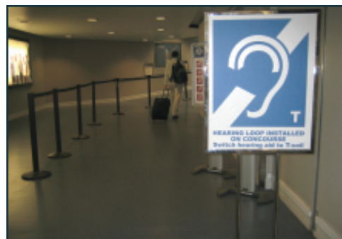
FIGURE 1. Sign announcing telecoil compatibility at the Grand Rapids Airport in Michigan.